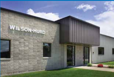
Berlin, WI High Volume Manufacturing Plant