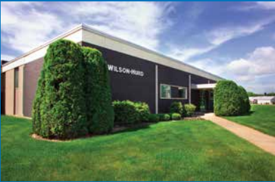
Wausau, WI Corporate Headquarters & Electronic Control Products Division