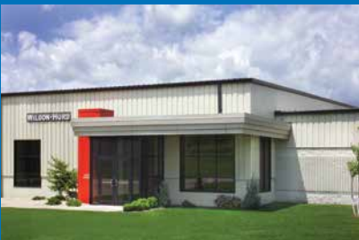
Berlin, WI Advanced Technology Facility

Wilson-Hurd, founded in 1904, offers custom printing, fabricating, and electronic manufacturing services. With our broad range of capabilities, Wilson-Hurd is able to serve a variety of markets including automotive, industrial controls, medical, telecommunications, appliance, food equipment manufacturers, POP displays, and cosmetic industries. An ISO 9001:2008 certified company, Wilson-Hurd's mission is to be the most respected provider in the markets served, consistently delivering solutions that yield exceptional value.