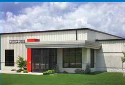
Berlin, WI Advanced Technology Facility

Wilson-Hurd, founded in 1904, offers custom printing, fabricating, and electronic manufacturing services. With our broad range of capabilities, Wilson-Hurd is able to serve a variety of markets including automotive, industrial controls, medical, telecommunications, appliance, food equipment manufacturers, POP displays, and cosmetic industries. An ISO 9001:2008 certified company, Wilson-Hurd's mission is to be the most respected provider in the markets served, consistently delivering solutions that yield exceptional value.