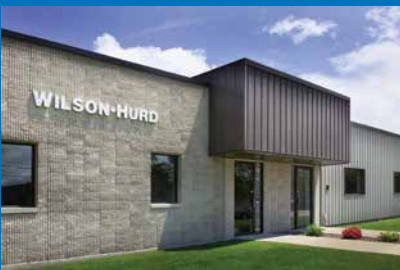
Berlin, WI High Volume Manufacturing Plant