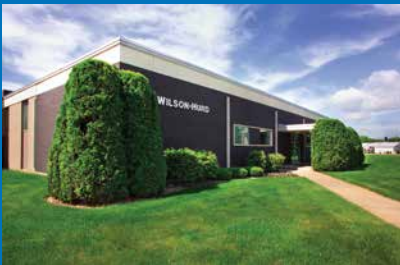
Wausau, WI Corporate Headquarters & Electronic Control Products Division