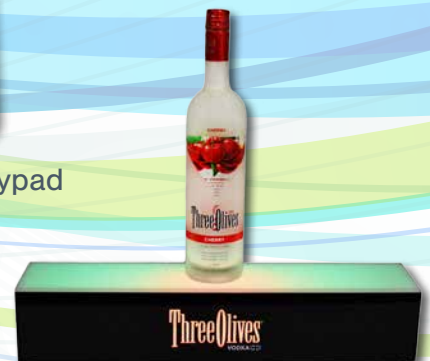
Acrylic Bottle Glorifier with LEDs