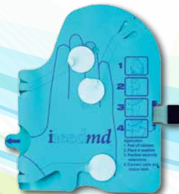
Disposable Medical Device