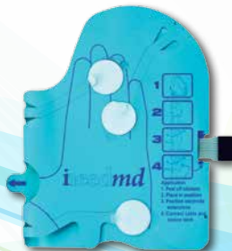
Disposable Medical Device