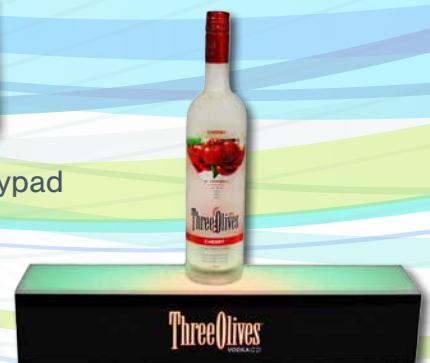
Acrylic Bottle Glorifier with LEDs